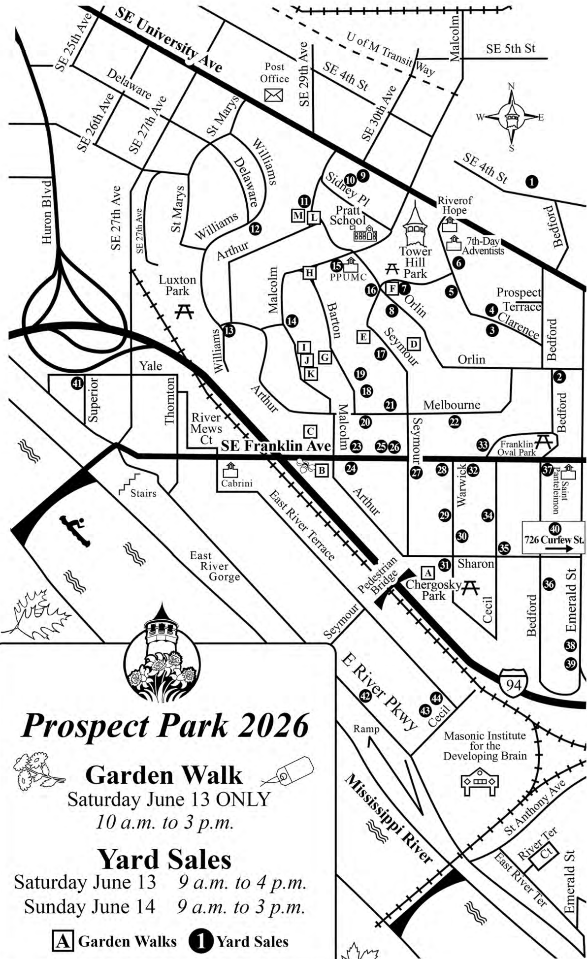
Map by Josh Purple 6/13/2026

Please DON'T BLOCK DRIVEWAYS OR PARK IN ALLEYS!