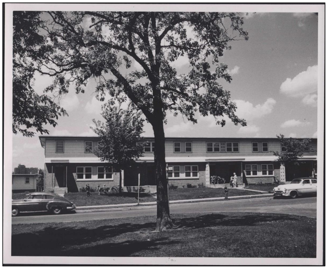
Unidentified townhomes at Glendale Public Housing, undated.