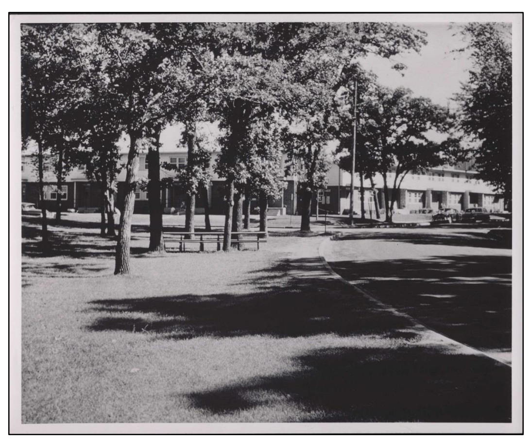
Unidentified street at Glendale, undated, note curving street and greenery. (James K. Hosmer Special Collections, Hennepin County Central Library)