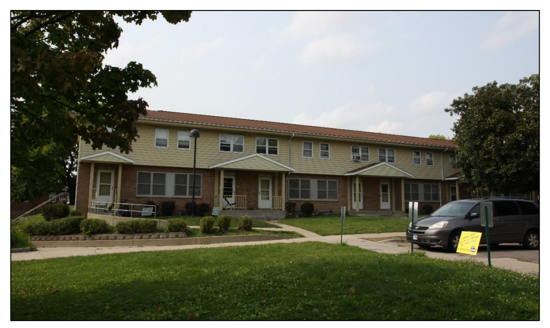
View northwest of 76-90 Saint Mary's Avenue Southeast. Note the redesigned porticos, altered roof, and loss of the aluminum framing at the second-story windows.