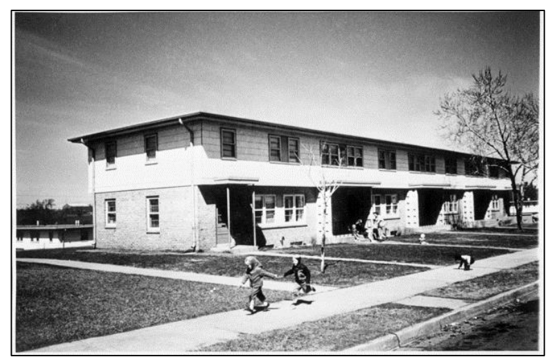
Children playing in front of Glendale, c. 1955.

In contrast, Glendale exemplified family-friendly public housing. The majority of the community's residents were children, who enjoyed easy access to Glendale's playgrounds and the neighboring park. Services grew as the project evolved. In March 1969, the project began offering the city's first privately funded Head Start classes, which attracted twenty children. All were eligible to start kindergarten the following fall, attesting to the number of families living there. A few years later, the Glendale Child Development Center opened and provided daycare for children living throughout the Prospect Park neighborhood.<sup>25</sup>