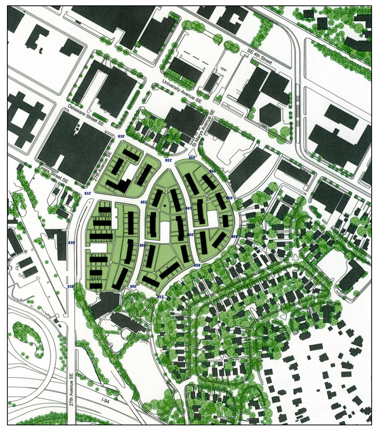
The Glendale Public Housing Project is shaded green. The Prospect Park Residential Historic District is to the east-southeast.