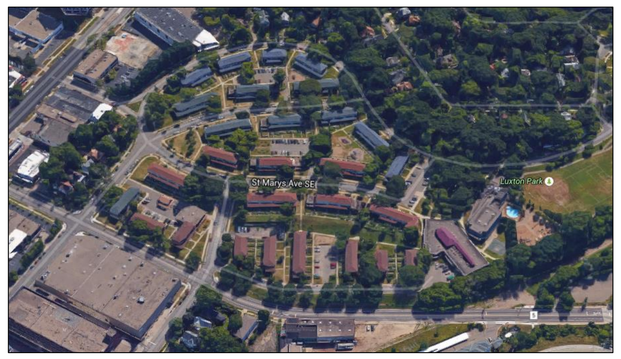
Glendale Townhomes: An Assessment of National Register Eligibility-Page 20