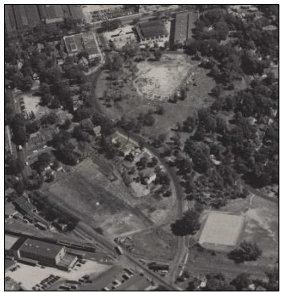
Detail from aerial view of Site F in August 1950. (James K. Hosmer Special Collection, Hennepin County Central Library)

Site F was located in Prospect Park, a Minneapolis neighborhood near the University of Minnesota. The area was first developed by real estate speculator Louis Menage in the late 1870s. The surveyors incorporated the topography into their plan following the approach of prominent landscape designer Andrew Jackson Downing, a proponent of curvilinear streets,