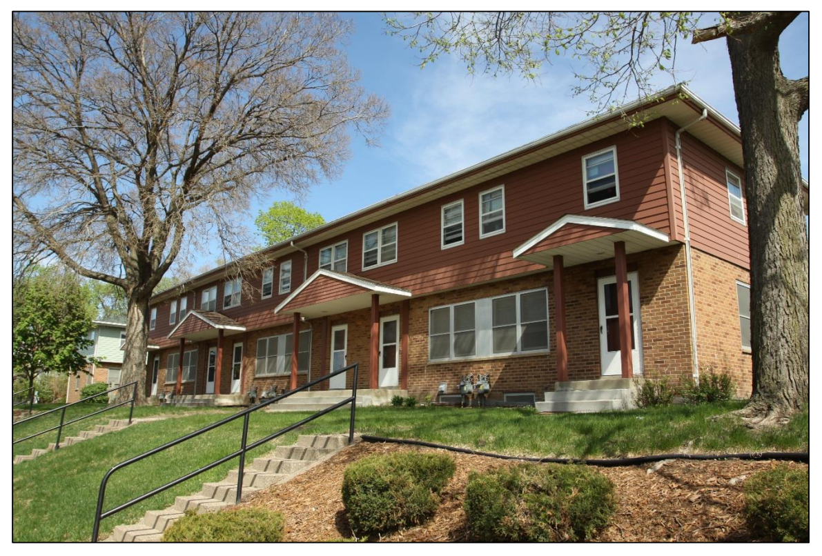
166-176 Twenty-Seventh Avenue Southeast, view east showing typical townhome.

Research was conducted in Hess Roise in-house files and at the Minnesota Historical Society, Hennepin County Central Library, Northwest Architectural Archives at the University of Minnesota-Twin Cities, and City of Minneapolis. Mid-twentieth-century records of the Minneapolis Public Housing Authority archived at the city's Community Planning and Economic Development Department were particularly helpful.