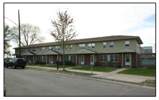
28-42 Saint Mary's Avenue Southeast, Type B, view northwest