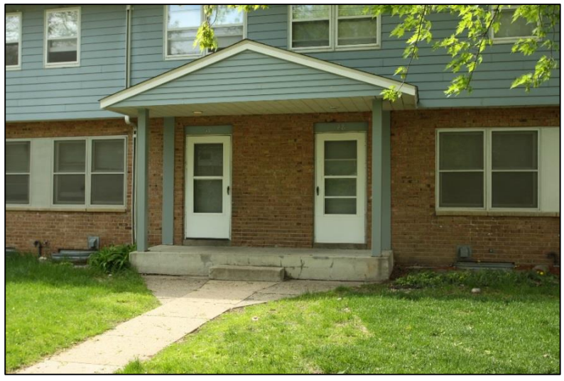
Shared portico on 42-52 Williams Avenue, view southeast.

Front doors were originally sheltered by flat-roofed canopies, which were supported by simple posts or precast concrete panels. Pilasters that flank some doors today indicate where the concrete panels were once attached to the brick walls. In 1989, the canopies were enlarged and modified with gabled roofs supported by rectangular metal posts. Concrete thresholds are sometimes approached by concrete steps.