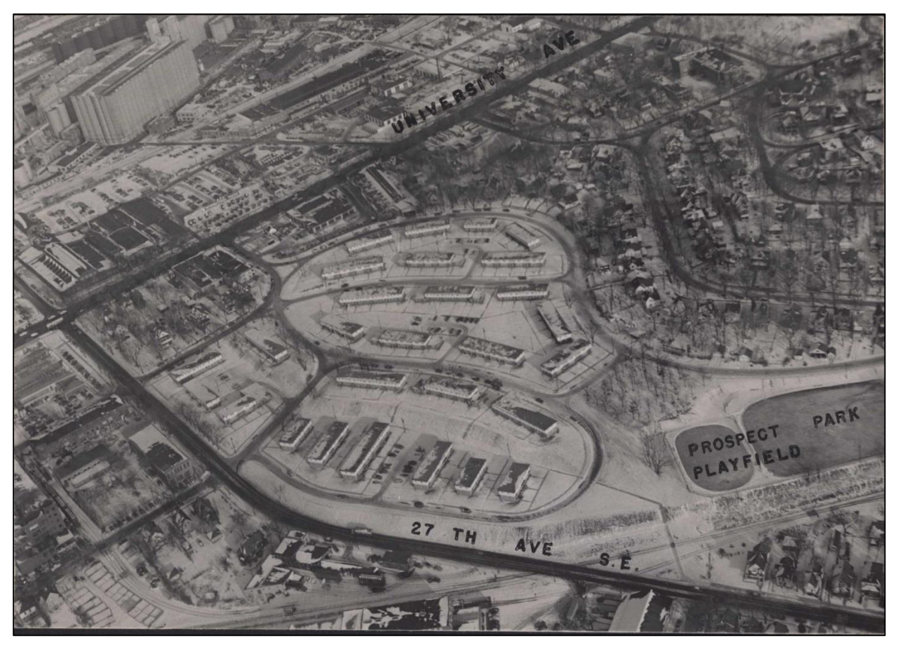
Glendale shortly after its construction (above; MHRA Archives, Minneapolis CPED) and today (below; Google Earth map). The integrity of the project's overall design is very good.