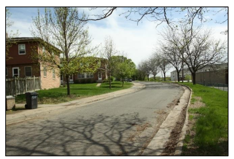
Twenty-Seventh Avenue showing the curvilinear street plan, view south.

The twenty-eight buildings feature six different plans (described in more detail below), but all are similar, giving visual consistency to the complex. Most units are two-story townhouses, with some single-story units at ends of buildings. The first stories of the buildings are clad in original brick veneer, and the second stories, which project