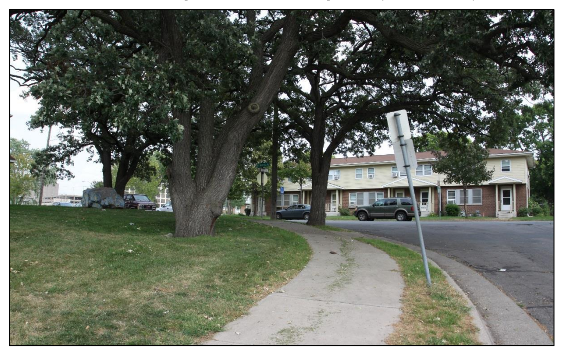
View northeast from the intersection of Essex Street and Saint Mary's Avenue showing the historic street alignment and landscaping.