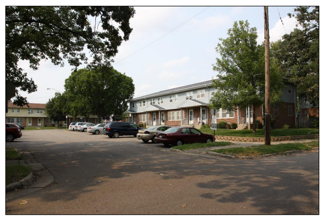
View northwest from Williams Avenue down Saint Mary's Place. The altered porticos and roofline can be compared with the original configuration in the photograph above.