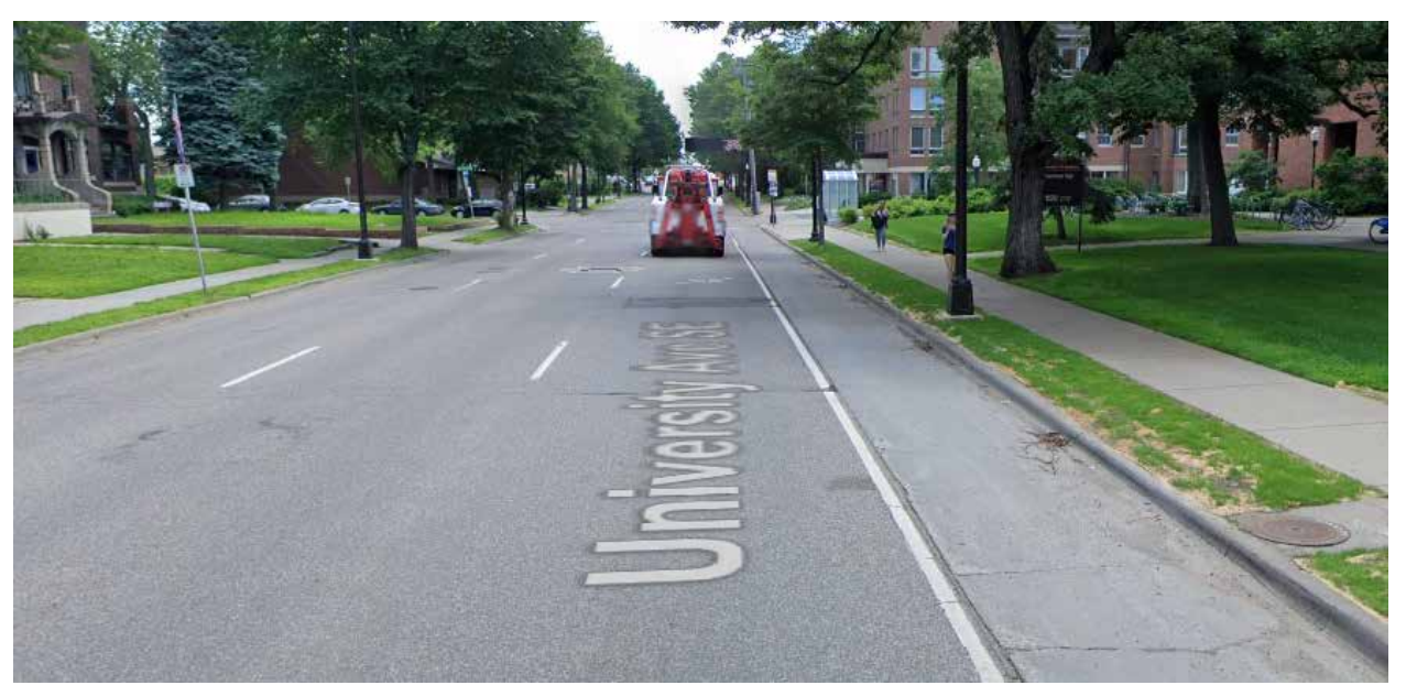
University Ave SE: Current conditions with three vehicle lanes and an unprotected gutter-pan bike lane

Hennepin County is currently consulting on re-design of University Ave and 4<sup>th</sup> St SE between I-35W and Oak St. With Oak St being the border of Prospect Park, these streets directly serve our neighborhood. The current layout of these streets channels traffic at high speed through a dense residential neighborhood. We thank Hennepin County for consulting about proposed changes in advance of a street reconstruction that will serve this area for the next fifty years.