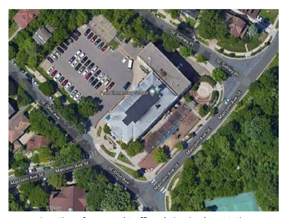
Location of proposed traffic calming implementation