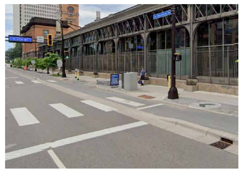
Curb height protected bike lanes on S. Washington Ave in downtown Minneapolis

prevent car drivers from parking in the bike lanes, which they currently do frequently on University and 4th west of I-35 (where these streets are MnDOT controlled). Most importantly, a curb-height bike lane would create a safer situation for the very many UMN students who bike the wrong way down the University Ave bike lane on a daily basis. Some of those students are Prospect Park residents.