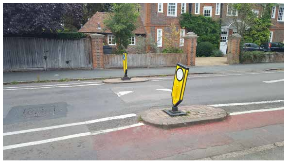
Semi-diverter narrowing roadway to one lane

Streets in Prospect Park are not proposed for reconstruction within the next five years. Therefore, to calm traffic in the short term and inform more permanent changes to the street, a variety of "tactical" changes can be made. In the United States and abroad, there are three main ways that temporary changes to street layouts can be made