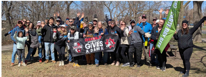
East River Parkway